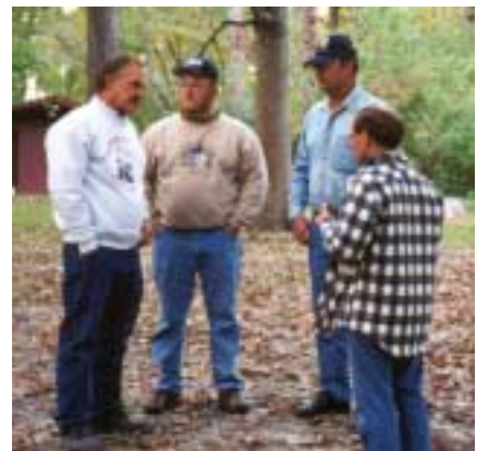
The picnic affords an opportunity for Ashton folks to gather in fellowship.