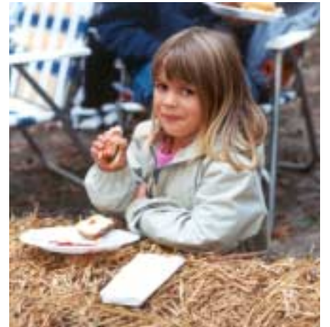
Miss Callaway finds a bale of straw works just as well as a picnic table.