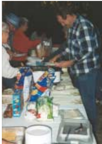
Picknickers enjoyed hotdogs, beef chili, chips, brownies, bars and cookies, lemonade, hot chocolate, and last but not least, toasted marshmallows.