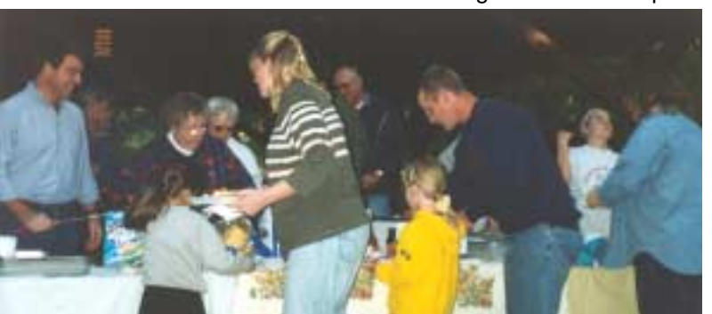
After football, hikes and a prayer, the crowd was ready to fill their plates.